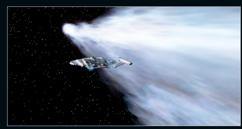
▲ The CG comet seen in 'Breaking the Ice' was based on photographs of several real-life comets, although to make it more dramatic this comet moved faster than the real thing.