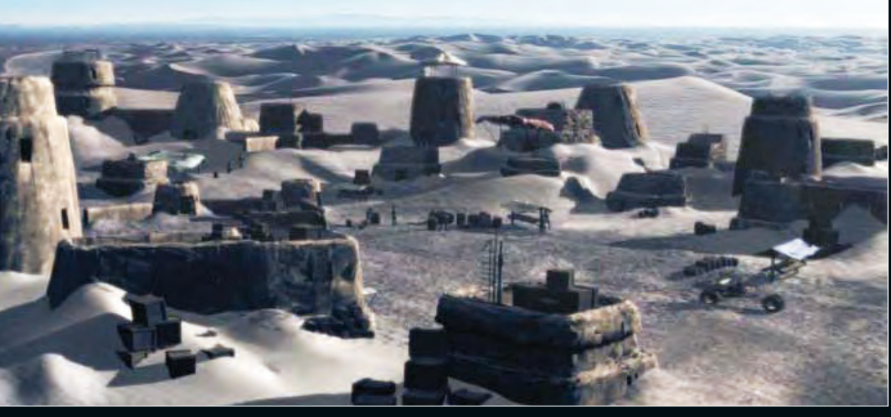
▲ The shots showing the settlement in 'Desert Crossing' were almost entirely CG. The only real element of the scene was the sand that was taken from digital still pictures Ron Moore had photographed while on location.

wheeled vehicle in there with a little CG person."