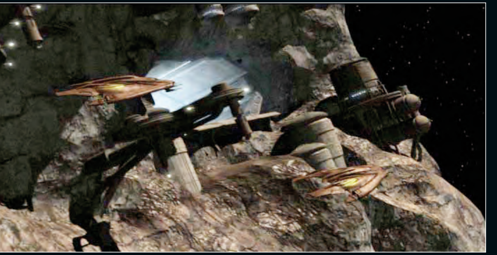
▲ 'Fortunate Son' also featured a major CG scene with a Nausicaan base that was built into an asteroid.

What Pienkos then did was separate the elements of the matte painting into several two-dimensional layers, which he put at different distances from the camera. At this stage they were like two-dimensional cutouts in a child's puppet theater. These flat layers were then pulled into a relatively shallow 3D