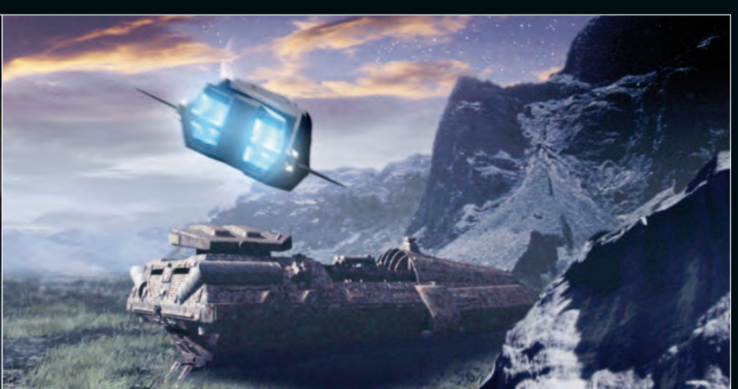
▲ VFX producer Dan Curry described this matte painting from 'Oasis' as "an interesting experiment." It involved combining distorted 2D layers with 3D elements to create perspective and fool the eye.

the first shot where we see the turned to look at the settlement, which shuttlepod coming in, everything is CG the sand dunes in the foreground are there were people walking around; there were tents blowing in the wind. Because some of the real plates had dune buggy treads in them, Ron (Moore) asked us to create some kind of motorcycle thing just to establish where these tread marks might have come from. We put a little CG three-