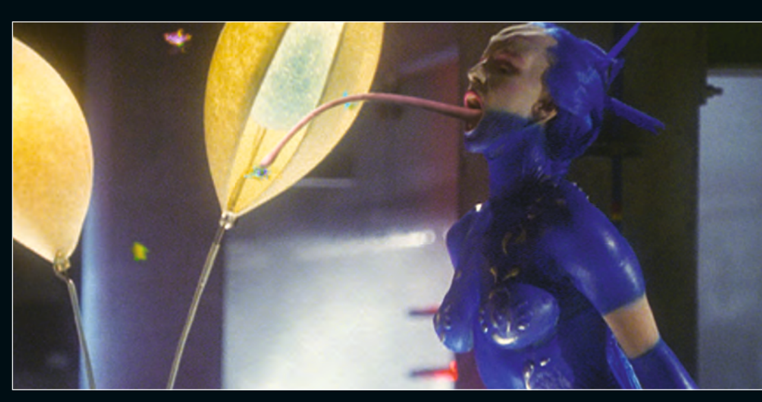
▲ CG tongues and butterflies were created for the dancing aliens on Rigel X in 'Broken Bow.' The end of the CG tongues had to be attached to the dancers' mouths in every frame so that it looked natural throughout the shot.