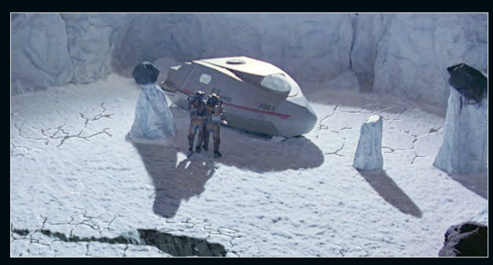
▲ For this shot of the ground collapsing around the shuttle, the team at Eden FX added CG around to the live action footage that had been filmed on the sound stage