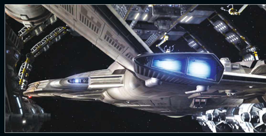
▲ The pilot involved a sequence of amazing shots that showed off the Enterprise NX-01 . The CG model was incredibly detailed and more photorealistic than any other ship that had been built for STAR TREK before.

Moore entered regular production with the episode 'Fortunate Son.' It featured new models of the ECS Fortunate Son, small Nausicaan fighters, and a base that was built into an asteroid, but many people probably didn't notice